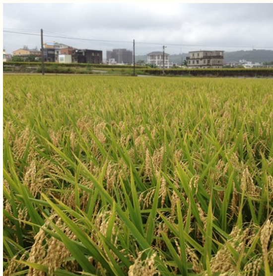
Fig. 2. After Miaoli No. 1 treatment, the yield has increased by 20~30%

The rice straw-decomposing microbial agents and Miaoli No. 1 are already developed as commercial products in Taiwan. If you need any further information on commercial cooperation or product supply, please feel free to contact the editor, and regarding the application techniques ATRI also can assist if needed.