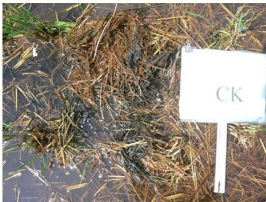
Fig. 1. After 7-14 days, the control group remains light brown and hard

In Taiwan, the decomposition of rice straw takes 45-60 days after harvest through simply chopped and mixed with soil without any additives. Taichung District Agricultural Research and Extension Station has developed an effective solution for this issue. The accelerating straw decomposition method, "a mix compound of microbial agents with rice straw-decomposing function", is using a mixture of multiple microorganisms, along with nitrogen, phosphoric anhydride, potassium oxide, magnesium oxide and other ingredients, which can accelerate rice straw-decomposing and efficient reuse. At 7-14 days after treatment, the straw turns brown and soften, which can increase the organic contents in the soil and raise up the yield for next grow season. The R&D result has already transferred technology to local companies, and three commercial fertilizers are available on the market.