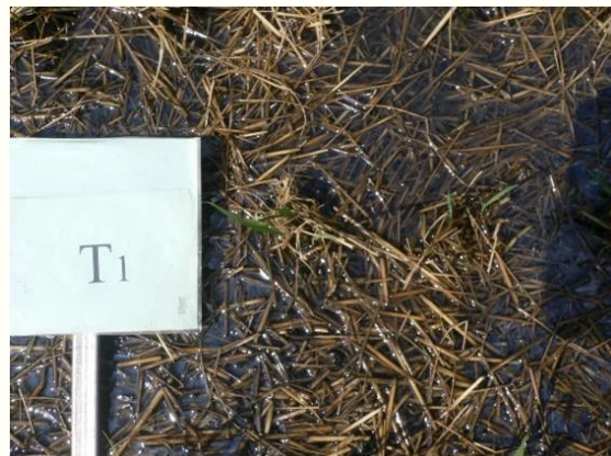
Fig. 2. At 7-14 days after microbial agents treatment, the straw becomes dark brown